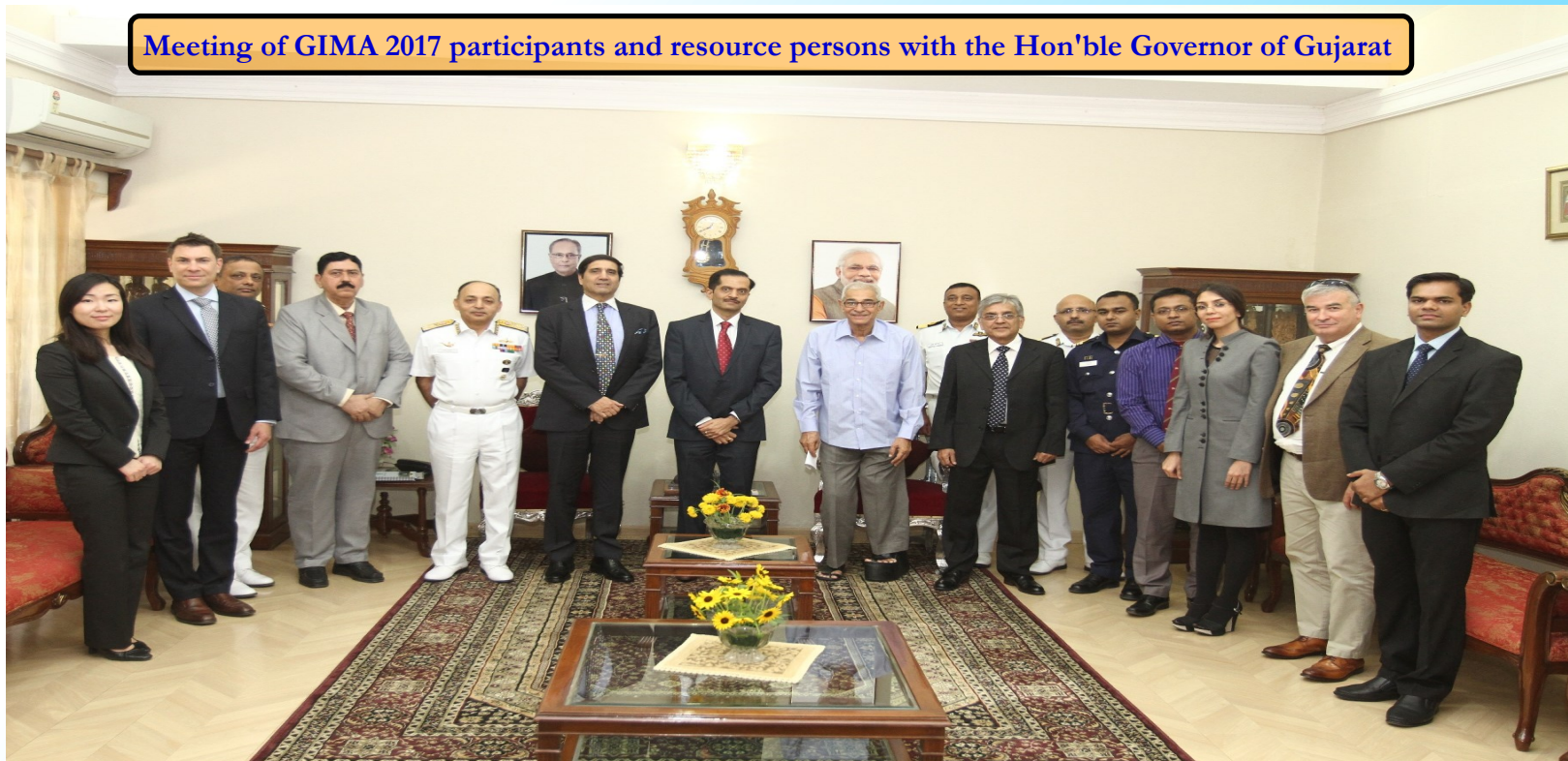
Meeting of GIMA 2017 participants and resource persons with the Hon'ble Governor of Gujarat

• Daily field/port/cultural and heritage visits.